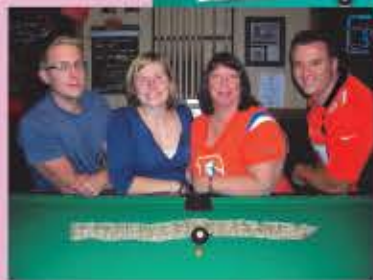
Best Rack Ever