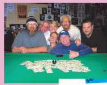
Chalk is Cheap